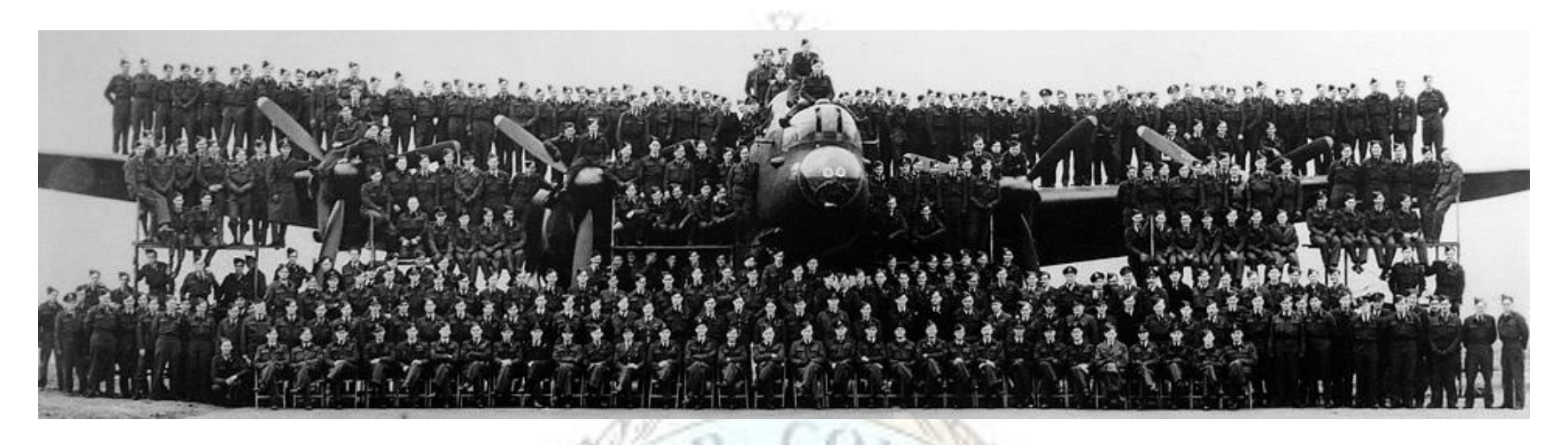
75(NZ) Squadron RAF